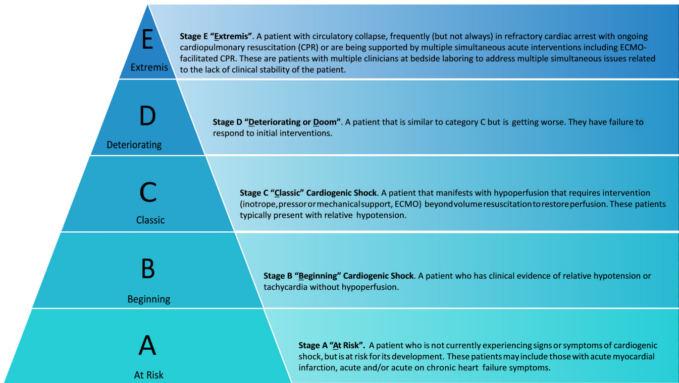
FIGURE 1 The pyramid of CS classification

a patient risk-stratifying tool. 17–21 Elevation of troponin in CS may identify patients who present late.